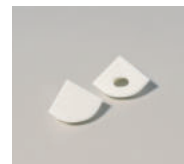
Plastic End Caps