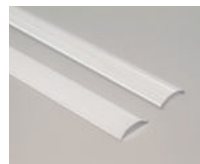
Frosted / Clear Diffuser